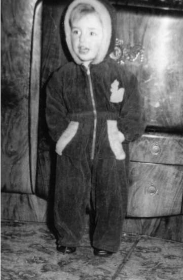
Me as a child - don't I look cute