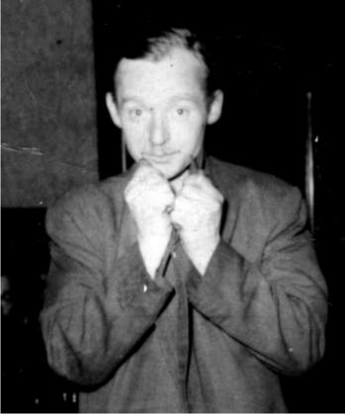
My dad looking shady