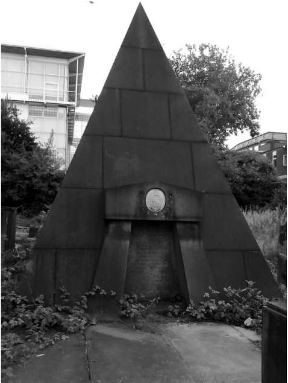
Mackenzie's Pyramid in Rodney Street Liverpool