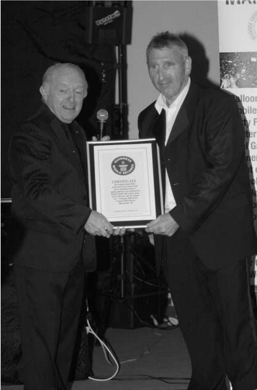
Paul Daniels presenting me with my Guinness world record certificate