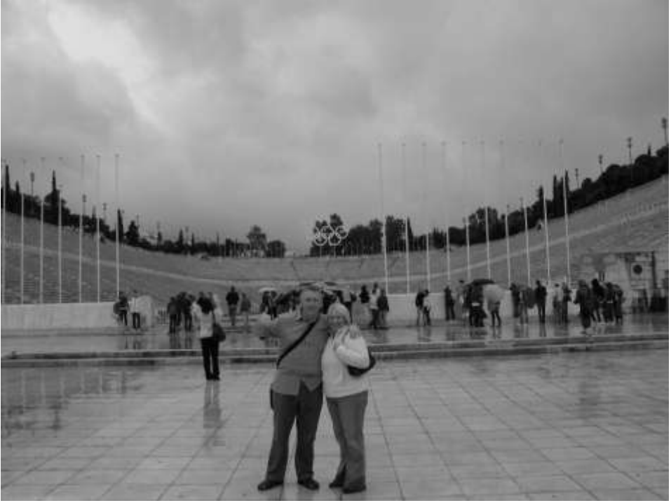
The Panathenaic Stadium Athens Greece