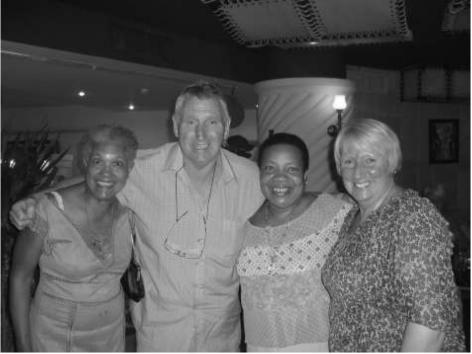
The Jamaican ladies we met in Egypt