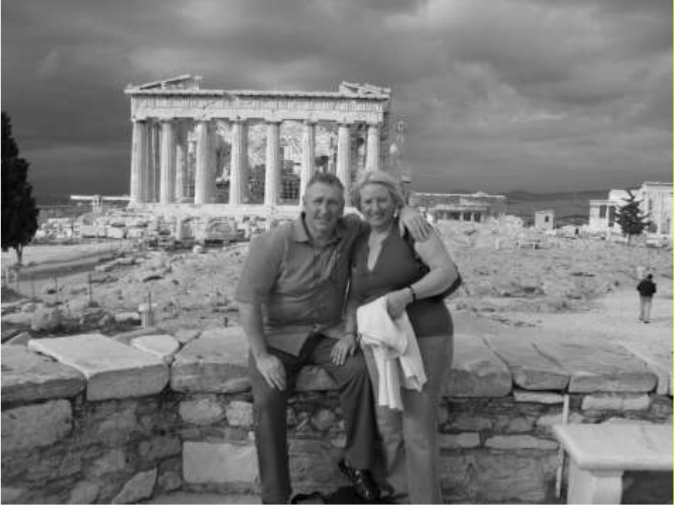
In front of the Acropolis in Athens, Greece another seven wonder of the world