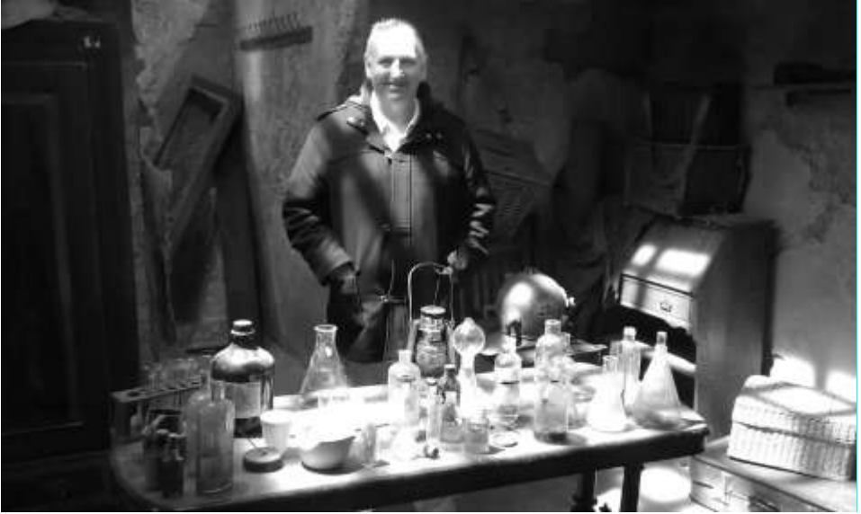
As a magic consultant for Nickelodeon's new smash hit series House of Anubis