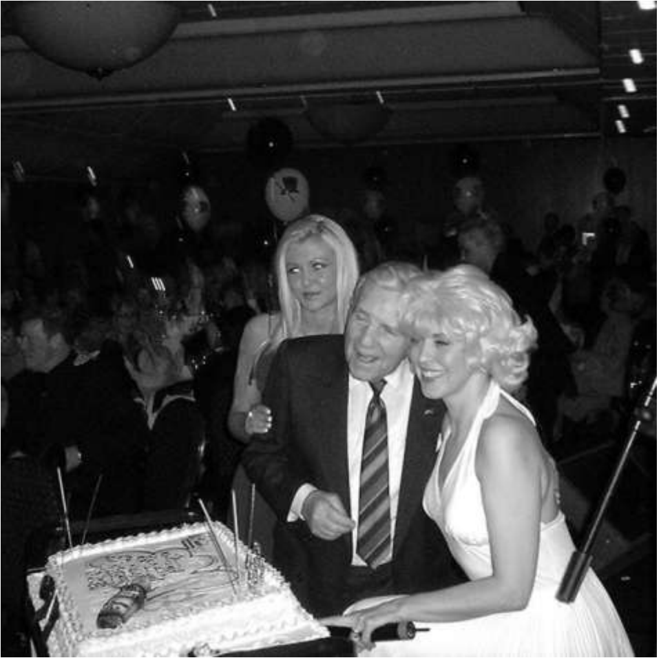
Sir Norman Wisdoms' 88 th Birthday Party