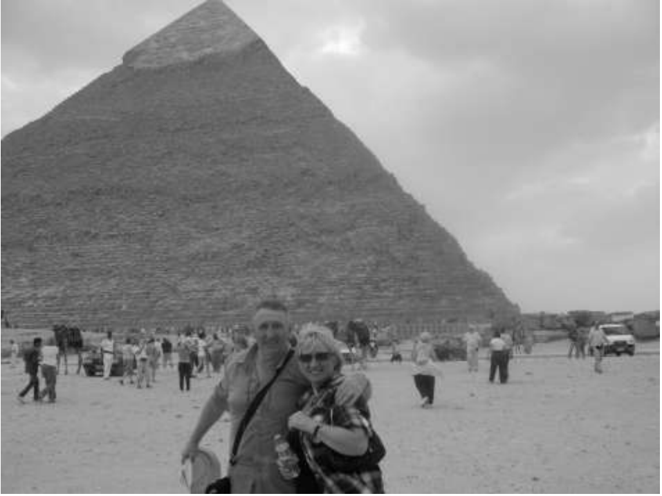
The great pyramid of Giza in Egypt another seven wonder of the world